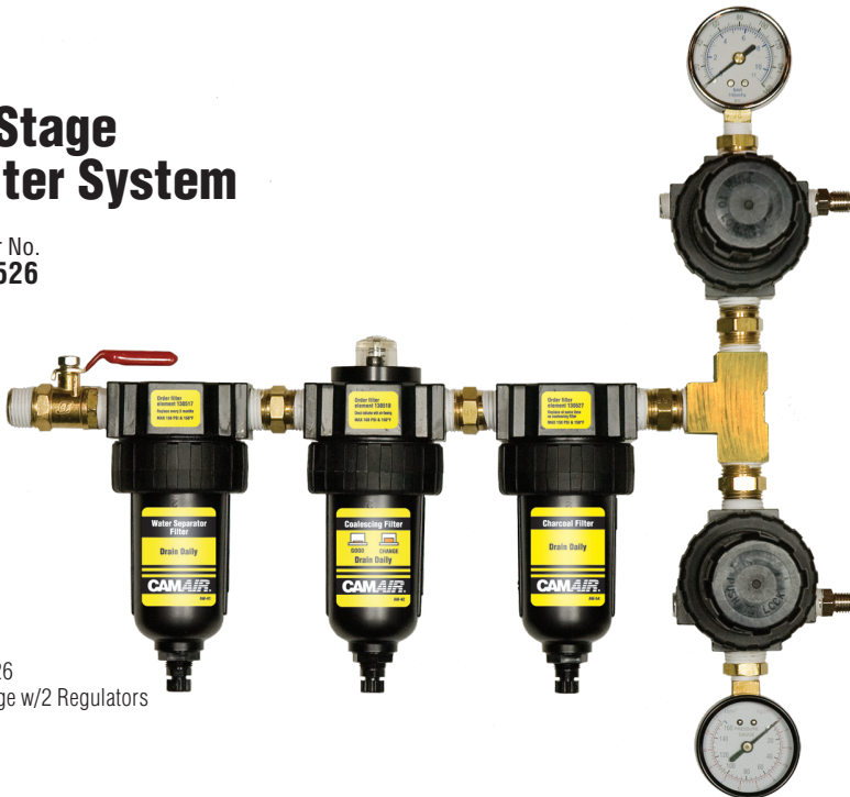
130526 3-Stage w/2 Regulators