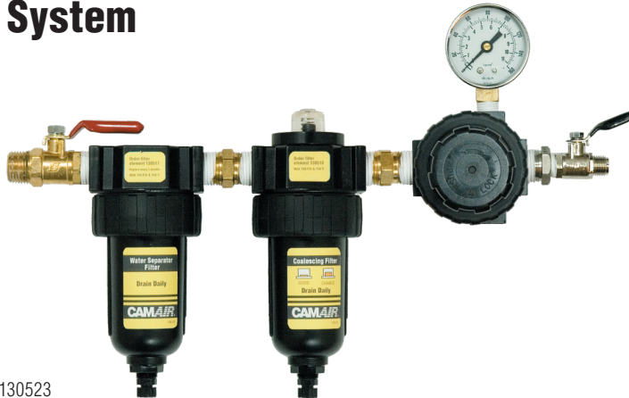
130523 2-Stage w/Regulator