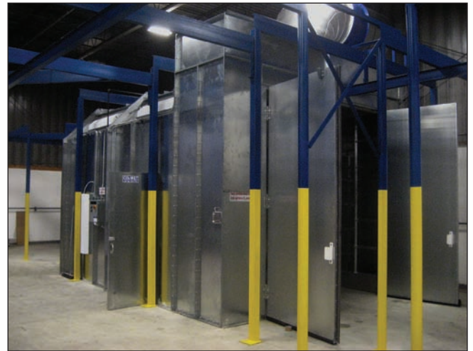
CUSTOM CAT BOOTH WITH CONVEYOR

Bright full booth illumination is provided by four-tube, 48", 32-watt fluorescent light fixtures in the angled ceiling panels and side walls. Each is mounted behind clear tempered safety glass and sealed with a gasket. All fixtures are UL listed and approved for their intended use and placement.