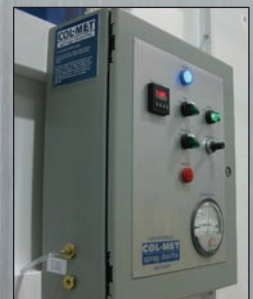
OPTIONAL CONTROL PANEL