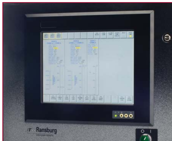
User-Friendly Back Lit LCD Touch Screen Panel Display