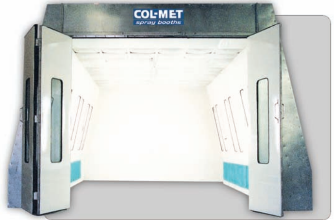
SHOWN WITH OPTIONAL COL-MET BOOTH COATING

Bright full booth illumination is provided by twelve 48", four-tube, 32-watt fluorescent light fixtures in the angled ceiling panels. Each is mounted behind clear, tempered safety glass and sealed with a gasket. All fixtures are UL listed and approved for their intended use and placement.