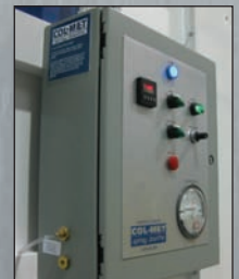
OPTIONAL CONTROL PANEL