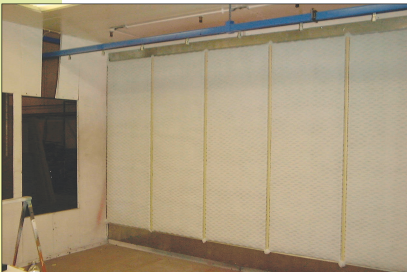
Paint Pockets Green shown in "Zipper™" mounting system.

CAN YOU REALLY AFFORD NOT TO USE PAINT POCKETS GREEN?