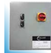
UL & ETL listed control panel