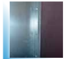
5/16" bolts with serrated lock nut