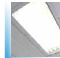
Industry-leading light levels