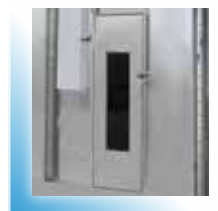
Windowed personnel access doors