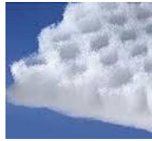
Polyester Pads & Rolls