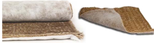
Expanded Paper Pads & Rolls