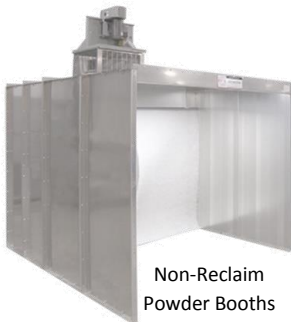
Non-Reclaim Powder Booths