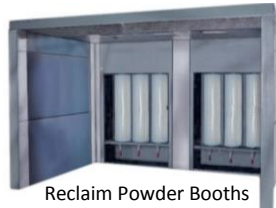
Reclaim Powder Booths