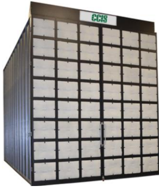
Modular Batch Powder Spray Booth