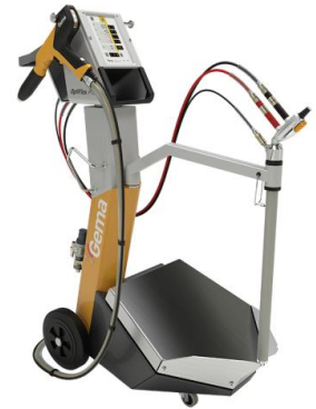
Gema OptiFlex Pro Manual Unit