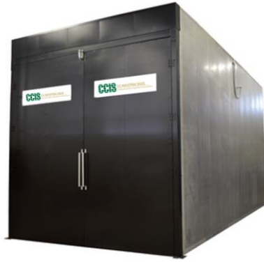
Modular Batch Powder Curing Oven